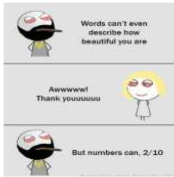
Fig. 11 Example 11

This meme (see Fig. 11) is an example of a humorous situation that arises from flouting the maxim of quality.