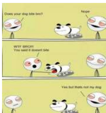
Fig. 9 Example 9

The humour in this situation lies in the unexpected and nonsensical responses from the man, which create a humorous contrast to the woman's sincere and romantic tone. The meme plays on the audience's expectation of a serious response to a romantic question, and subverts that expectation with a humorous twist.