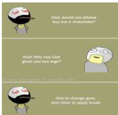
Fig. 3 Example 3

Overall, the humour in this meme is based on the incongruity between the absurdity of the seller's statement and the woman's naive acceptance of it. The violation of conversational maxims and the resulting miscommunication between the seller and the woman create a humorous and entertaining situation.