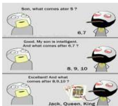
Fig. 12 Example 12

Overall, this meme is an example of a humorous situation that arises from flouting the maxim of quality, as the girl's response is unexpected and subverts the expectation of a positive response to a compliment.