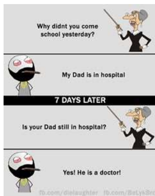
Fig. 10 Example 10

The humour in this situation lies in the unexpected and playful responses from Bro 2, who subverts Bro 1's expectations and takes the question in a different direction.