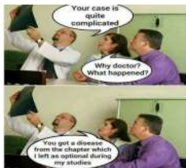
Fig. 4 Example 4

The humour in this situation lies in the playful and unexpected response from the son, which subverts the father's expectation of a serious conversation and adds a humorous twist to the interaction. The meme also plays on the audience's expectation of a serious and responsible attitude from parents and children, and subverts that expectation with a humorous justification for wanting a motorbike.