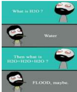
Fig. 1 Example 1

This meme (see Fig. 1) is an example of a humorous situation that arises from flouting the conversational maxim of quality.