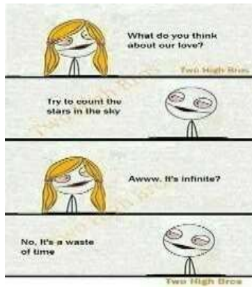
Fig. 8 Example 8

This meme (see Fig. 8) is an example of a humorous situation that arises from flouting conversational maxims, specifically the maxim of relevance.