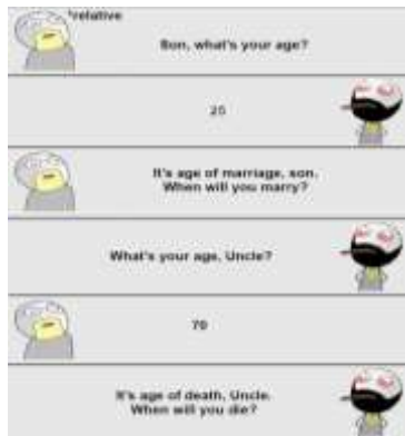
Fig. 14 Example 14

resulting miscommunication between the bro and Tina create a humourous and entertaining situation.