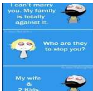
Fig. 7 Example 7

The boy's final response, "Even if I tell you, you wouldn't believe me," is a classic example of the use of irony. The boy implies that the policeman is not capable of believing his answer, even though the answer is obvious and straightforward. The final punchline, "Near my house," adds to the irony and reinforces the boy's sarcastic attitude. Overall, the humour in this meme is based on the clever use of language and the unexpected responses of the boy, which violate the conversational maxim of relevance in a humorous way.