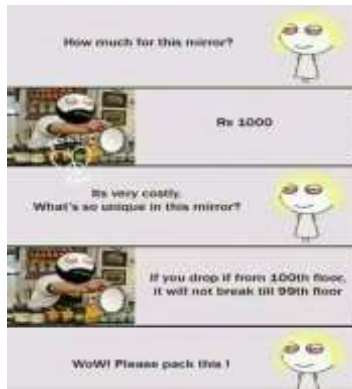
Fig. 2 Example 2

The humorous situation in this meme (see Fig. 2) is a result of the seller flouting the conversational maxim of quality, which requires speakers to provide truthful information. When the woman questions the high price of the mirror, the seller responds with a humorous exaggeration about the mirror's durability. By suggesting that the mirror will not break until the 99th floor if dropped from the 100th floor, the seller is clearly providing an absurd and untrue statement, thus violating the maxim of quality.