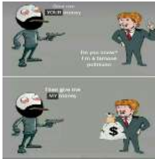
Fig. 5 Example 5

This meme (see Fig. 5) plays with the conversational maxim of relevance, which states that participants in a conversation should only say things that are relevant to the topic being discussed. In this case, the robber is asking for money, and Trump responds by pointing out his fame as a politician, which is not relevant to the request. The robber then flouts the maxim of quantity by being intentionally ambiguous with his statement "give me MY money," which could be interpreted in different ways. The humour comes from the ironic twist that the robber is able to turn the tables on Trump, who is used to being in control and in a position of power.