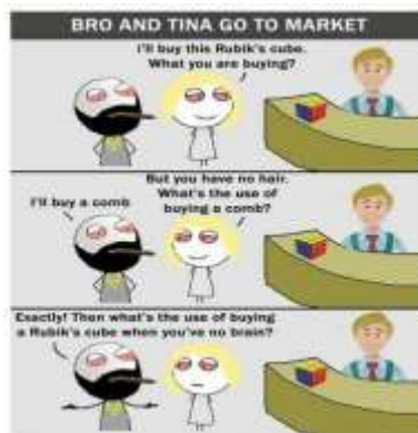
Fig. 13 Example 13

The humorous situation in this meme (see Fig. 13) is a result of the bro flouting the conversational maxim of manner, which requires speakers to be clear and concise in their speech. The bro responds to Tina's question about what he's buying with a sarcastic and unexpected comment that is not directly related to the question. By doing so, the bro is deliberately violating the maxim of manner, which can create confusion and humour in the conversation.