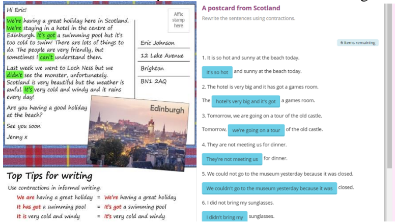
Figure 1. A Postcard from Scotland. British Council (n.d.)

Here is an example of interactive online learning activity on the British Council website.